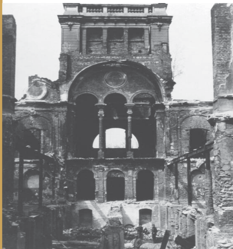
New Synagogue burned by Nazis, 1939

By the second half of the 19th century, more than a third of the population was Jewish. Christian and Jewish common concerns allowed everyone to live in relative harmony until the German occupation of Poland in 1939 when life changed dramatically.