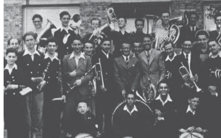
Hebrew Grammar School orchestra, 1930s