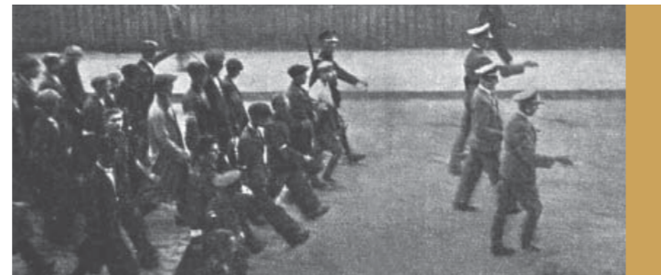
Deportation from Częstochowa, 1942

On September 3, 1939, the third day of World War II, Częstochowa was the first Polish city taken by the Wehrmacht. The next day, German troops murdered some 300 inhabitants, mainly Jews. Anti-Jewish regulations were immediately enacted forcing them to wear Star of David armbands. Businesses and real estate were confiscated. Schools and synagogues were closed. Germans set up a Jewish Council – the Judenrat – to implement Nazi orders. On the first anniversary of Kristallnacht, November 11, 1939, the magnificent New Synagogue was destroyed.