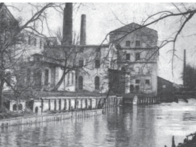
Warta factory, 1920s