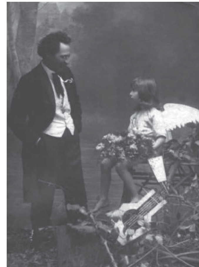
Hebrew Grammar School play, 1930s

For Jews, education was a religious obligation. Pre-school and elementary level cheders were founded in the early 19th century. As early as the 1840s, progressive Jews ran a school which combined secular and new thinking in Jewish education. By the early 20th century, some 4000 Jewish students attended some fifty cheders while others studied in yeshivas. Almost 5000 Jewish children attended general elementary and mid-level schools, most of them managing dual curricula simultaneously. Trade schools also attracted many students.