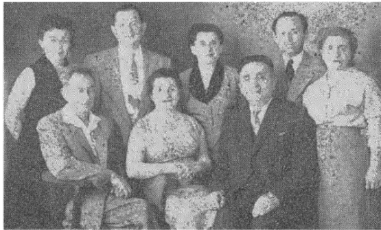
Częstochowers in Israel

The quoted sums and the number of members, who have utilised of our Charitable Loans Funds, demonstrate not only that they are put to effective use, but also the vital need of the members. It has been possible to carry out this important work thanks to the tireless, devoted activity of a limited number of members, for whom the will to succour our Częstochower comrades is near to their hearts and who use their influence in order to achieve this goal.