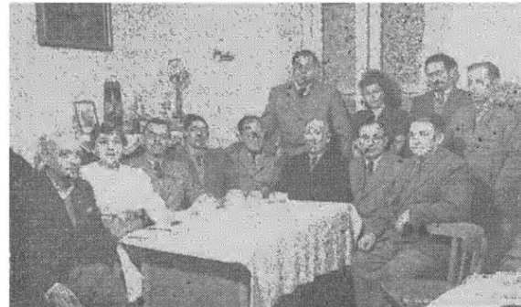
Organisation of Częstochowa Jews in Israel, Tel-Aviv