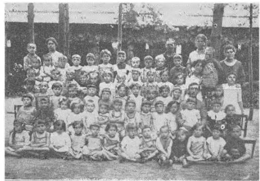
Day camp in Ostrów