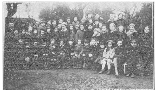
Children and collaborators of the afternoon school in Częstochowa, scholastic year 1938-39