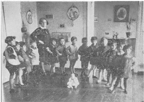
The children's rhythmic gymnastics at the I.L. Peretz Workers Kindergarten in Częstochowa, 1928-29