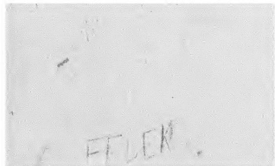
Signatures found on the walls inside the bunkers