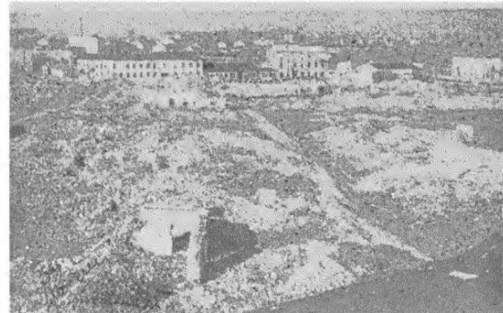
The ruins of the Częstochowa Ghetto, which was demolished by the Nazis following the liquidation, in which hundreds of Jews were annihilated