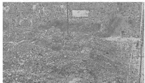
Fragment of the destroyed Small Ghetto