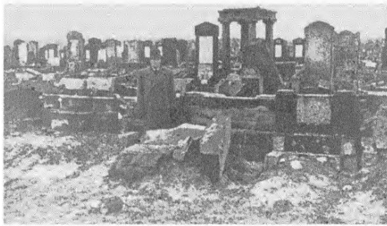
The cemetery in Częstochowa after the Destruction