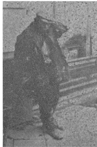
"Tzimmes," the town madman