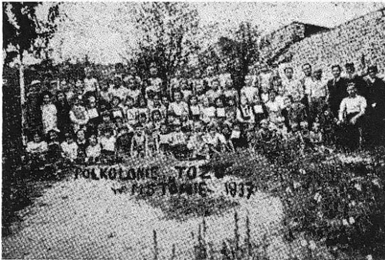
“TOZ” camp for Jewish children in Mstów

The poor Jewish child, who always feels that the ground he walks upon is not his and always sees angry looks from the surrounding vicinity and often “catches” their knocks, is heartened by the motherly warmth that prevails in the children’s commune at the summer-camp, where the good food and the fresh air, warm his frozen neshumele [Yid.; little soul].