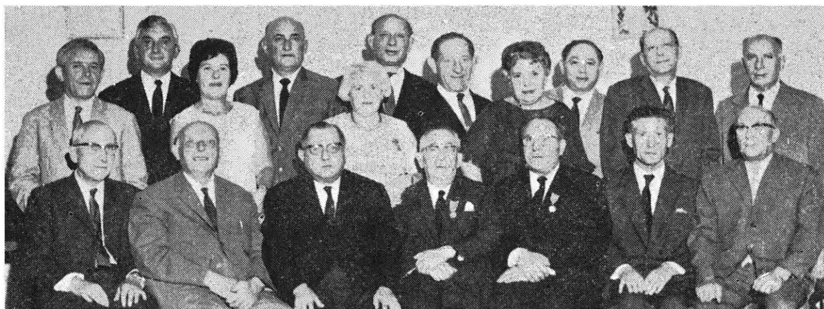
The Committee of the “Friends of Częstochowa” Society in Paris.