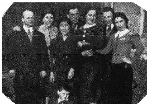
The Kantor family members