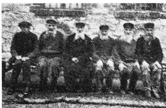
A group of old men from the "Dobroczytność" aged care home, in normal times

Częstochowa landsleit in America, through their "Częstochower Aid Association" and, later, through the "Częstochower Relief", generously helped to cover such a large budget.