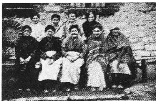
A group of old women who lived at the aged care home of the "Dobroczytność" society