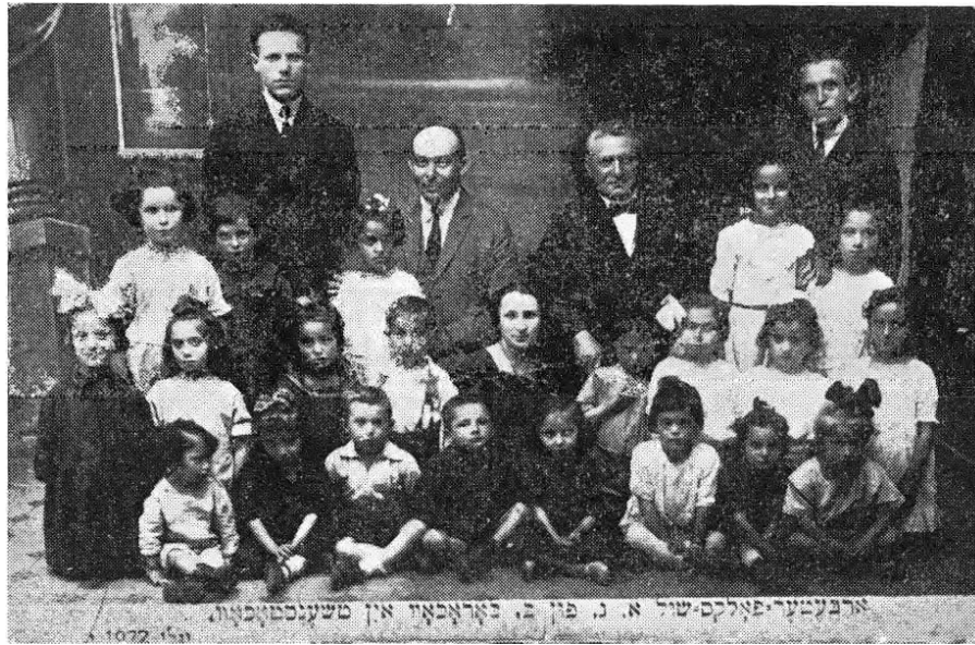
[B. Borochof Workers' Primary School (July 1922)]