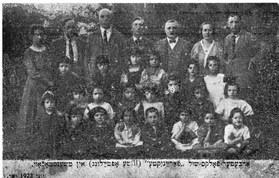
["Vereinigete" [United] Primary School (Grade 2) (June 1922)]